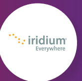
Iridium Satellite Communications