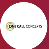
One Call Concepts