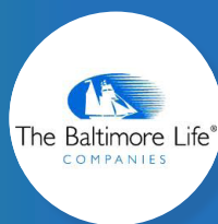
The Baltimore Life Companies