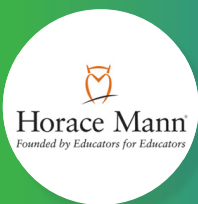
Horace Mann Educators Corporation